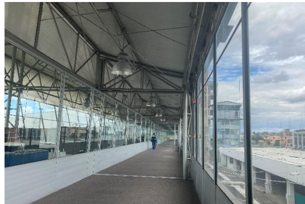
2 nd floor - inside