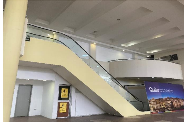
1 st floor – main hall