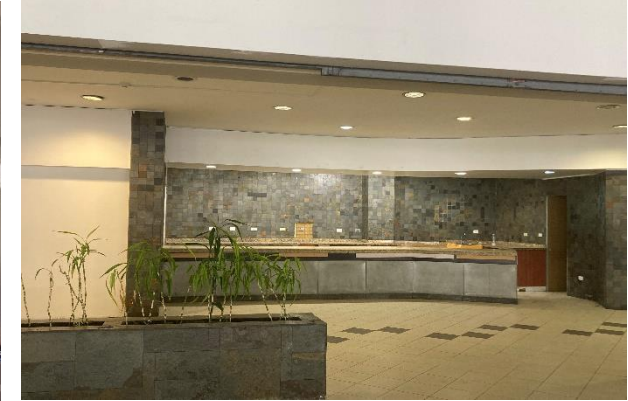
1 st floor – reception