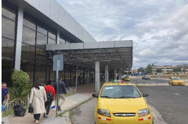
Outside of the building