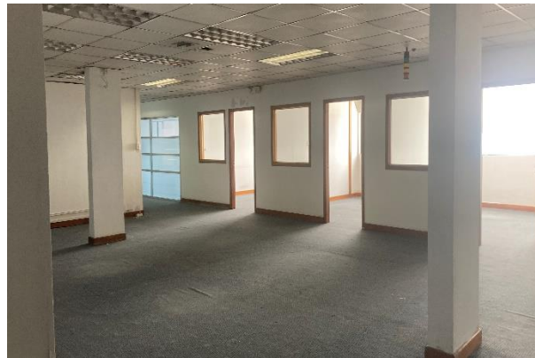
3 rd floor - lobby