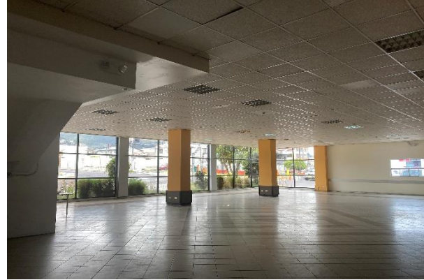
1 st floor - lobby