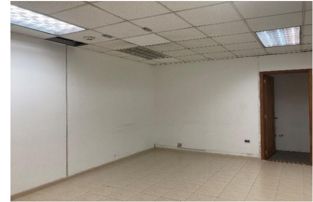
3 rd floor – room