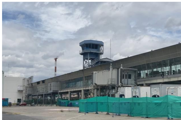
2 nd floor - Outside of the corridor