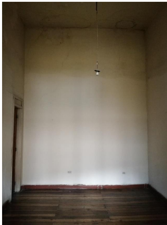
F_33 N+12.25 Habitación