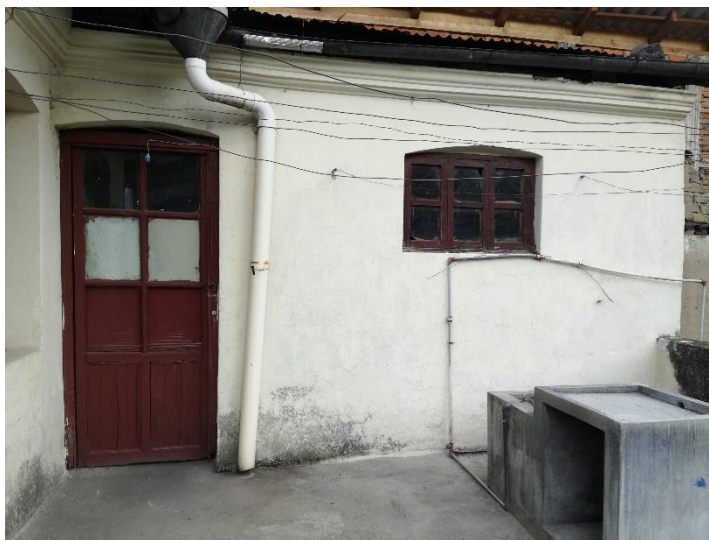
F_36 N+11.82 Terraza