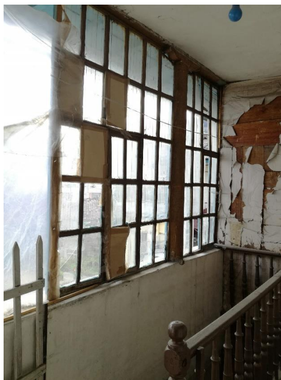
F_37 N+12.01 Escalera