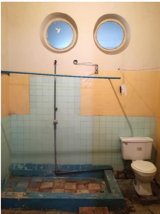
F_32 N+12.25 Baño