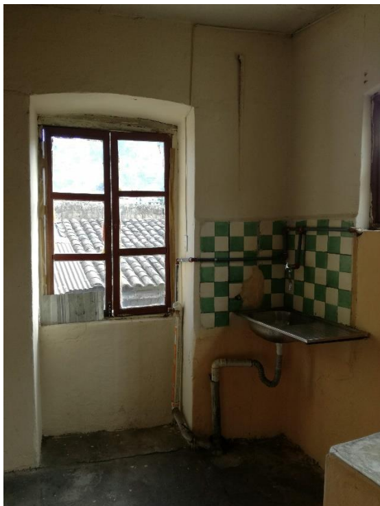
F_35 N+12.06 Cocina