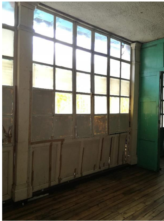
F_30 N+12.25 Corredor