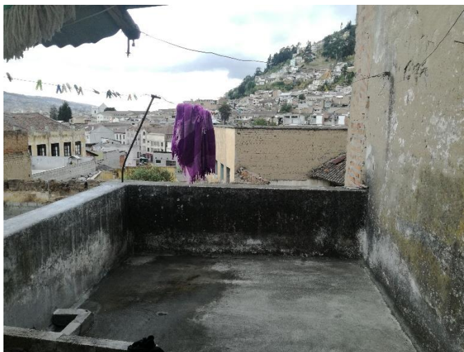
F_39 N+11.85 Terraza