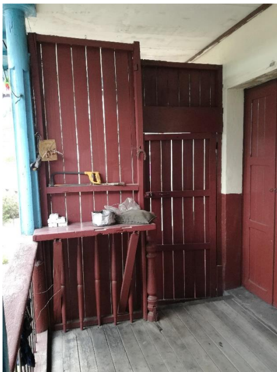
F_38 N+12.01 Escalera cruja occidental posterior