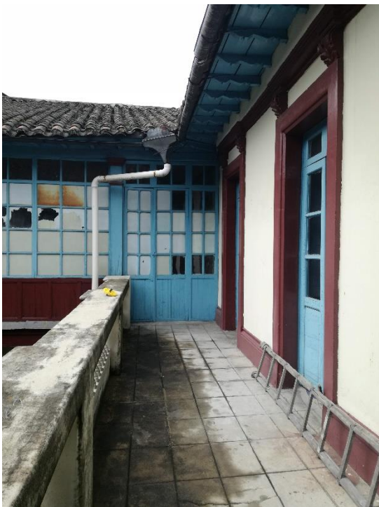
F_29 N+12.25 Terraza Patio central