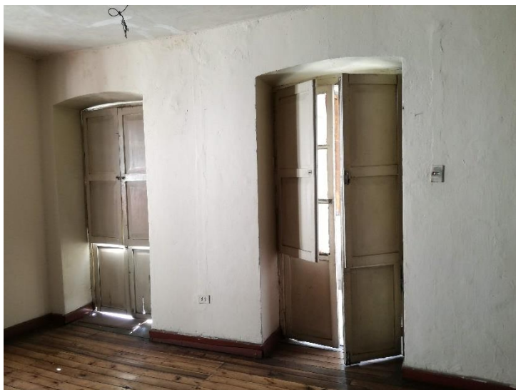
F_34 N+12.01 Habitación